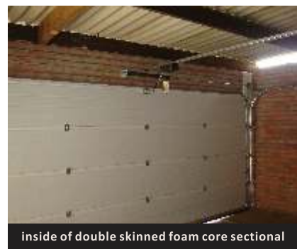
inside of double skinned foam core sectional

These doors can also be spray-painted in a special colour of your choice.