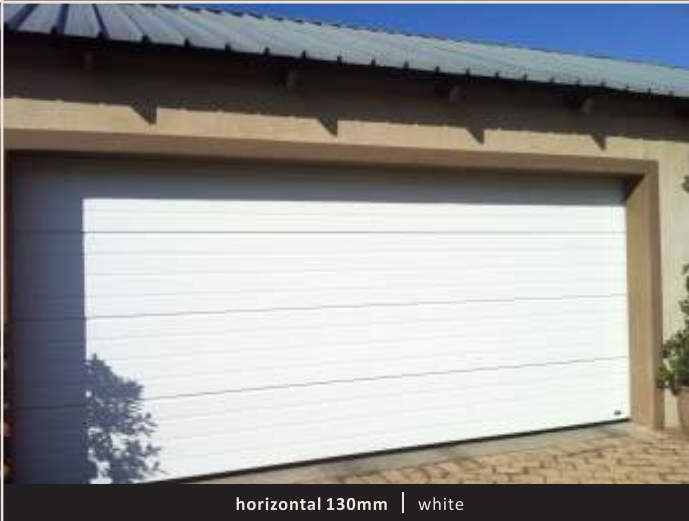
horizontal 130mm | white

F oam core steel sectional doors are filled with a polyurethane hi-density foam to provide superior strength, insulation against heat and cold and better noise reduction.