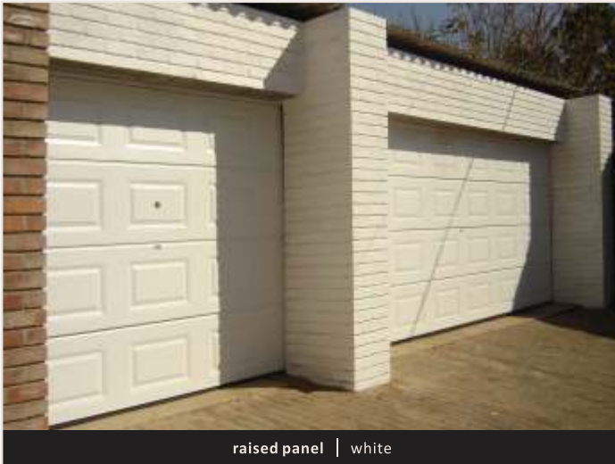
raised panel | white