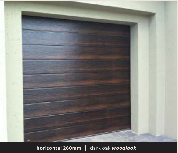
horizontal 260mm | dark oak woodlook

These doors are extremely durable and require minimal maintenance. Optional vision windows in various designs can be fitted to suit your design choice.